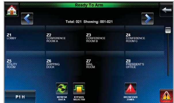
Zone List Screen